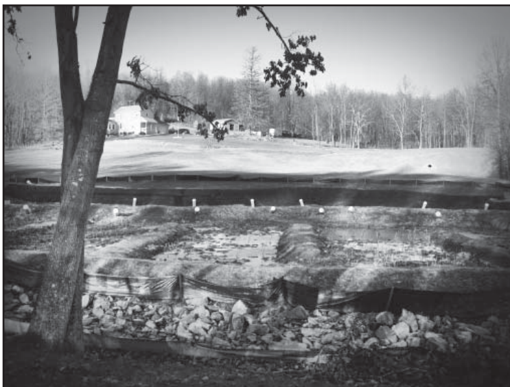
Mineral Zoar Project