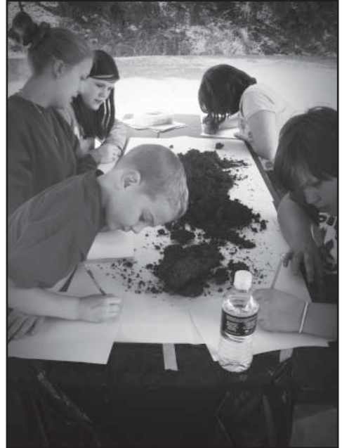
In April, EEC members learned about soil.