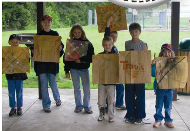
Explorers show off their recycled kites